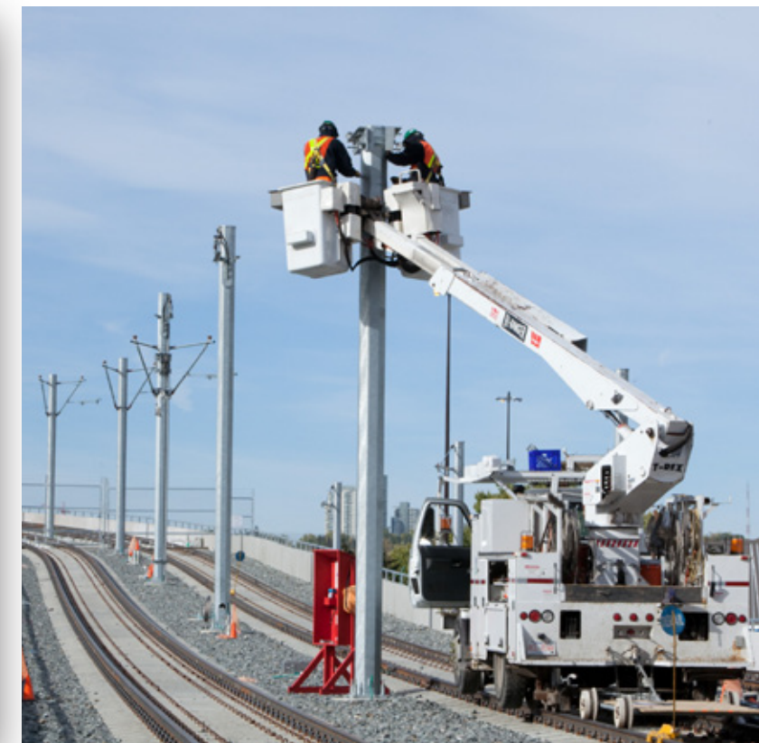
Installing overhead catenary poles on the LRT elevated guideway

Will the copper on the West LRT Station canopies turn green? In some climates, copper will turn green over time, like the roofs on Canada's Parliament Buildings. Due to the climate in Calgary, the copper will lose its sheen and become dull in colour, resembling the colour of an older penny. For specific information and updates on your neighbourhood station, check out westlrt.ca and look under the Station Areas tab.