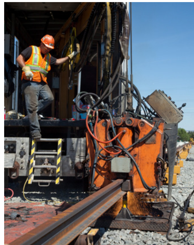
Welding LRT tracks near 47 Street S.W