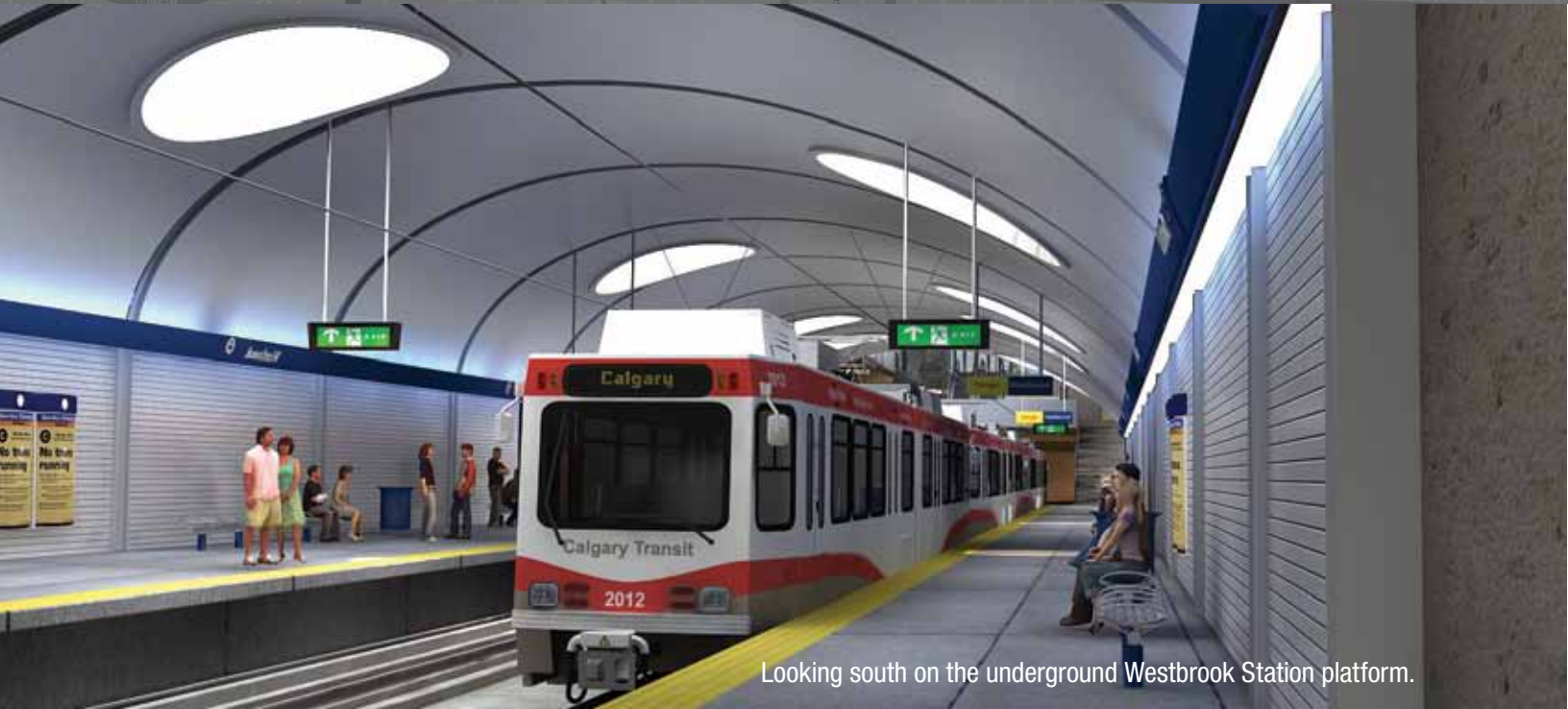
Looking south on the underground Westbrook Station platform.

For more information on the West LRT, visit westlrt.ca .