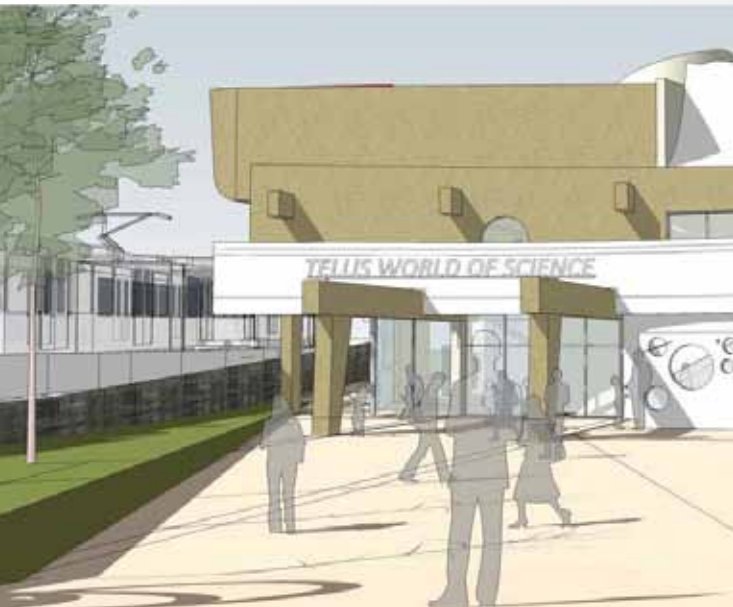
Future east entrance – December 2009

The TELUS World of Science is open for business during building modifications and West LRT construction. The new parking lot and vehicle access on 11th Street S.W. takes you to the temporary visitor entrance on the west side of the building. Modifications to the south side of the building are underway and will be complete in December 2009. For more information on the TELUS World of Science, its exhibits and hours of operation, please visit their website at calgaryscience.ca .