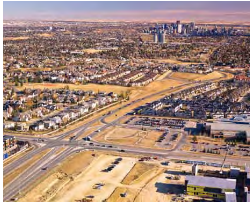
Looking east from the 69th Street Station site to downtown.

In anticipation of a growing population in the area, The City, Province and Calgary Board of Education approved a third wing for the West Calgary High School. This addition will enable 1,800 students to attend West Calgary High School. Construction on the third wing will begin in March, with the school scheduled to open for students for the fall 2011 semester. For more information, please visit westlrt.ca or cbe.ab.ca .