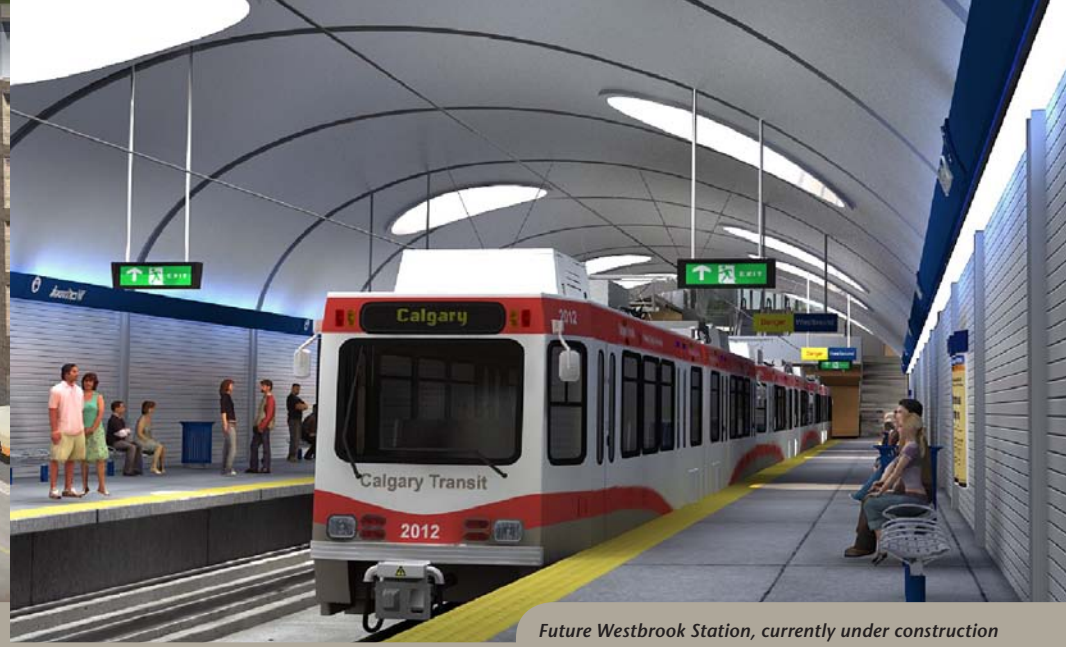
Future Westbrook Station, currently under construction