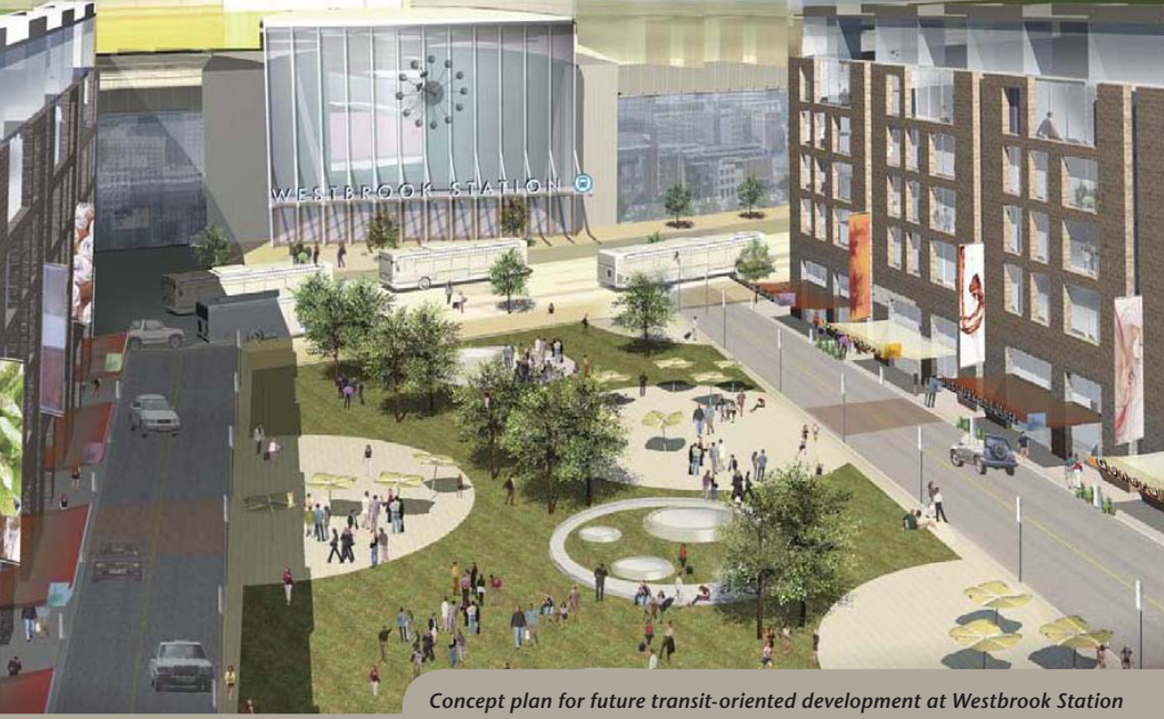
Concept plan for future transit-oriented development at Westbrook Station