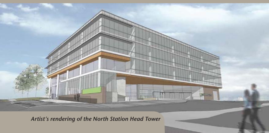
Artist's rendering of the North Station Head Tower