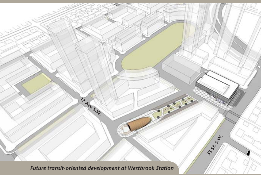
Future transit-oriented development at Westbrook Station